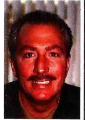
Jeff Trumper, Broadcastspots.com

We use it to buy everything from Mother's Day flowers to exotic vacations, so why shouldn't buyers use the Internet to purchase media? Whether it is using the Internet to purchase directly, or using the Internet as a time-saving tool, these three fairly new Internet companies are banking on media professionals to embrace the e-business solution.