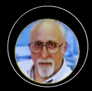
The NAB Radio Show & NAB Xstream Joint Keynote Walter Mossberg Columnist. The Wall Street Journal