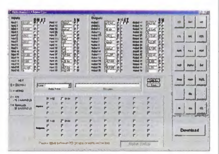
A soft panel display from BE's OZ router

More and more, as Esparolini says, Ethernet is being used as the communications platform for control and command. Routers are now being designed similarly to Local Area Networks (LANs) in the computer realm. "Some of the more recent routers are starting to use a little bit of Ethernet. A CAT-5 cable can be used for both the RS-422, RS-485 RS-232 and LAN Ethernet protocols. What you do over the CAT-5 makes all the difference in the world," Esparolini explains. "You need to be able to transmit the signal a longer length. Now radio guys are starting to discover their plants are really big and realize that 'just making what I have bigger' is not the way to go."