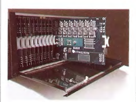
Wheatstone's Bridge 2001 router cage

from a control room or studio. Multiple wires will plug in to these cards from locations all over the station, limited only by the number of channels available on each card. For outputs that need to go to different places in the plant, there is either another card cage designated as an output cage or if the router is flexible enough, output modules can plug right in next to the input modules. Wires are run out of those output