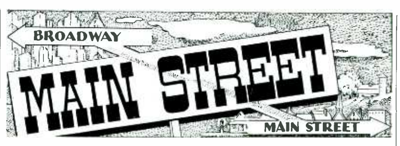
By TED GREEN

Entirely re-styled...a newer MIAMI BEACH OCEAN FRONT - 40th to 41st Sts. COMPLETELY AIR-CONDITIONED N.Y. OFFICE: TR 4-3193 YOUR HOSTS, The Family Jacobs