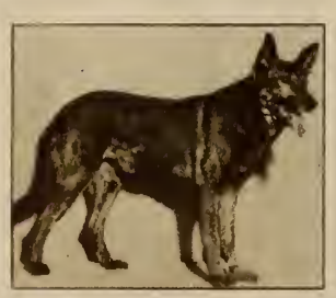
"Highnoon" the "radia dog" is one of the most interesting and unusual features of WLW.