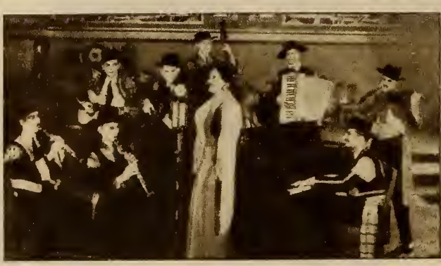
The click of castanets accompanies the tangos and other Spanish airs played by the WLW "South Americans."