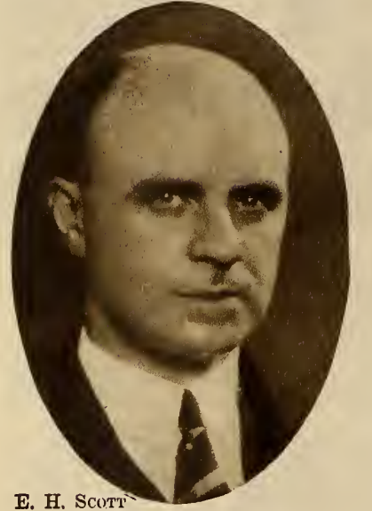
Pioncer Designer of 'round the world broadcast receivers.

Seven years ago, newspaper and magazine editors gave columns and columns of space to the amazing performance of a theretofore unknown receiver. They heralded the advent of transoceanic reception, on the broadcast band (200-550 meters) as the greatest radio achievement of the age. They named the receiver "World Record Super," because it brought in 117 programs from 19 stations, ALL OVER 6000 miles away, and WITHIN THE SHORT SPACE OF 13 WEEKS.