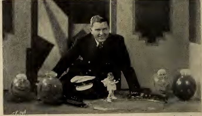
Steambaat Bill, with the toy balloons, tay steamboat, toy train, and Trixy Doll, which he sends to the boys and girls who send in box tops.

This is just one example of how WLS advertising pays. It pays because it brings RESULTS!