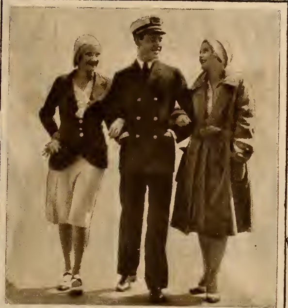
Operators on ships see the world and get good pay plus expenses. Here's one enjoying shore leave.