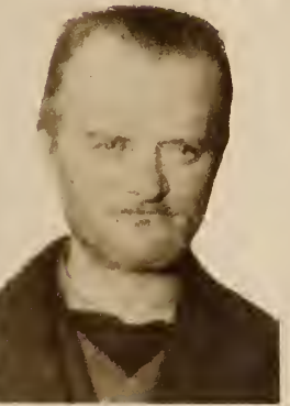
King of Hoboes