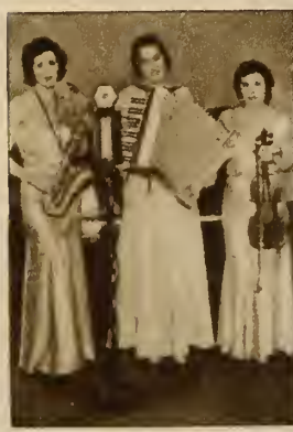
The Moriu sisters add spice and variety to many WLW programs.