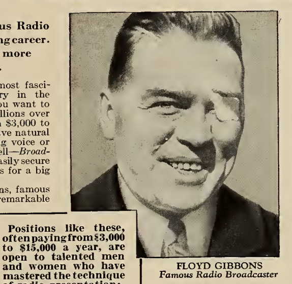
FLOYD GIBBONS Famous Radio Broadcaster