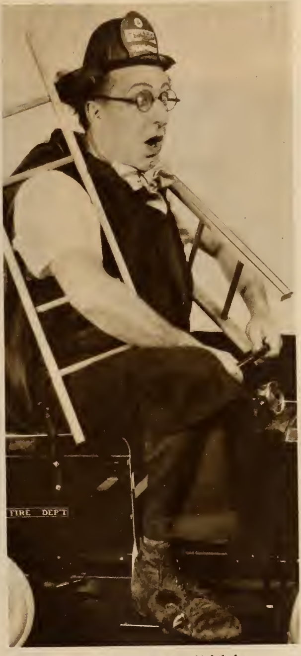
Clang! Clang! The Fire Chief dashes out to join Radio's Laugh Parade.

THE Wynn program has definitely set the trend. Tastyeast and Ivory Soap seem to be out to corner the market. Pepsodent grabbed Amos 'n' Andy when they suddenly flared up with amazing popular interest at WMAQ in Chicago. For a while there were imitators of Amos 'n' Andy but imitators never do so well. The fact that people who listen to these two black face comedians might respond to other forms of humor and philosophy was slowly recognized and then the parade of comic character entertainers began to grow.