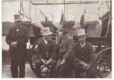
RADIO GUIDE'S MUSIC CRITIC IN LOCH LOMOND . No motor cars have been allowed to enter this comantic region . . .

1:00 am. CDT ←> 12:00 Mid. CST VBBM—Acound the Town; Dance O chestras WGN-Ital Kemp's Orchestra WIND-International Melodies