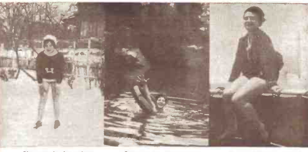
. She goes in for winter

Eventually, I decided that I might do better in another city. I migrated to Philadelphia, and miracle of miracles, in two days' time I was a full-fledged member of the staff on a Philadelphia daily paper! True, It want the larger paper in town, nor was the salary I received of any great