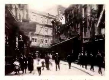
In the Heart of Chinatown in New York City

torn and bruised. Over the entrance is a sign: "Stop! If you haven't a friend in the world you can find one here". Every evening at ten o'clock a service is