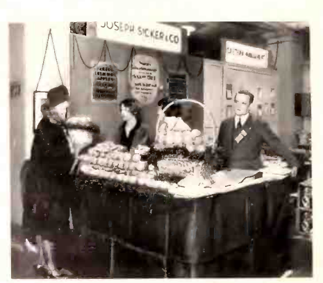
Tested by 1,000,000 people in the Pennsylvania Railroad Station.

Carton containing one dozen selected Golden Delicious Apples (which retail at $1.50) will be sent to each new subscriber who sends $2 for a year's subscription to the RADIO REVUE, along with this picture.