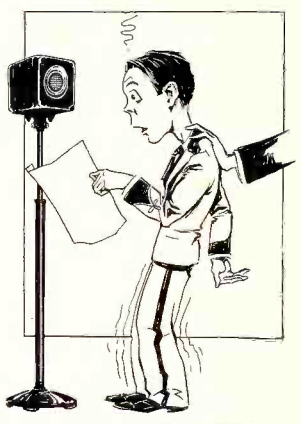
"I felt kind of pale and wolbby"

A successful radio show was held from February 10th to 16th in the Armory Radio Salon, Jersey City, by the Hudson County Radio Dealers, Inc. The list of artists what volunteered their services would be a veritable "Who's Who'" of radio.