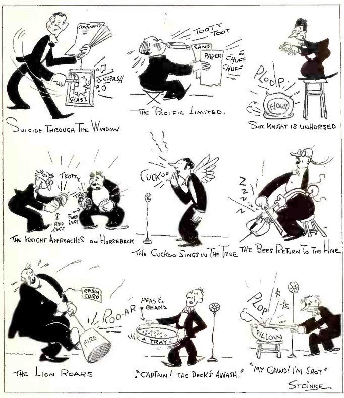
Proving that things are not really what they seem over the air.

The fiercest roars hang on separate pegs along the wall. That big one at the last, which is a real old whiskey-keg with pierced drumhead and resined cord, is the same "lion" that roared from the screen in the first showing of motion pictures brought back by Thodotor Roavelt from the "River of Doubt"—that fantastic stream that was supposed to flow uphill.