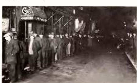
Souls in Pawn-The Famous Bread Line

Only last month an old lady in New Jersey wrote him to say that she had broken her ear-trumper and could no longer hear his program. Within a few moments he was able to announce that an ear-trumper thad been donated by a listener in Poughkeepsie. In this way last year, he was able to furnish to the needy twenty-one wheelchairs, ten loudspeakers, one express wagon, three Persian care, as many canazies, a score of crutches and artificial limbs, several trivelyes one bicycles a cuckoo clock and a parrot,