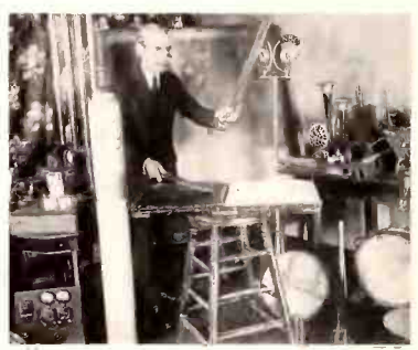
Waiting for the signal to start the "battle".

loading of the animals into Noah's Ark. For, tumbled along his shelves are the voices of every known creature under the heavens.