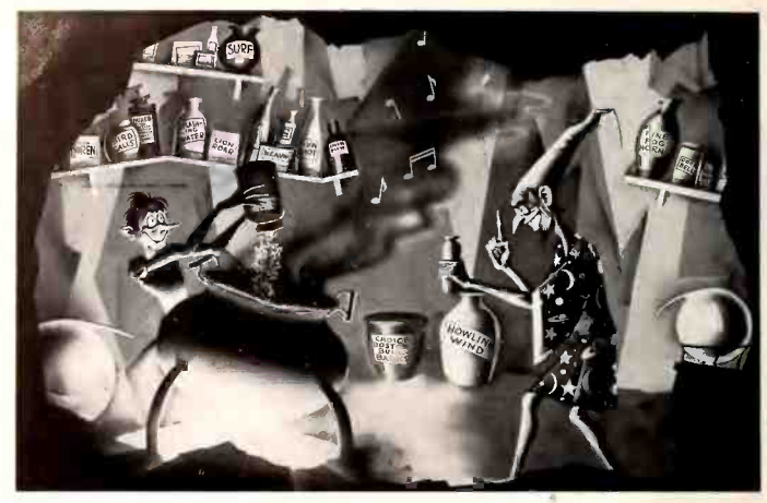
Sound Laboratories More Thrilling Than Fingal's Cave.

framework of resonant wood six feet square is stretched a cowhide. The usual sheet of tin couldn't fool the microphone, which only emphasized its futile metallic rattle. The special thunder-drum had to be built, in order to create satisfactory rumbling echoes.