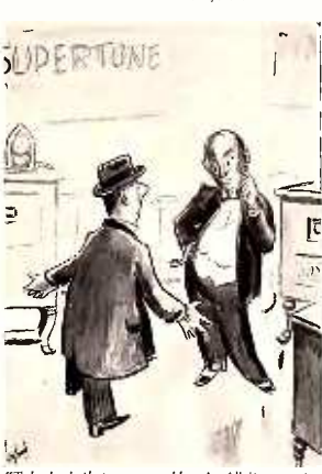
"Take back that set you sold me! All it can get is static and sopranos!"