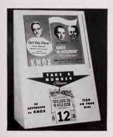
KMOX merchandising display easel

A new idea in merchandising cooperation with clients is being distributed to seven hundred grocery and meat market outlets, who serve millions of customers each month in the Greater St. Louis area by KMOX.