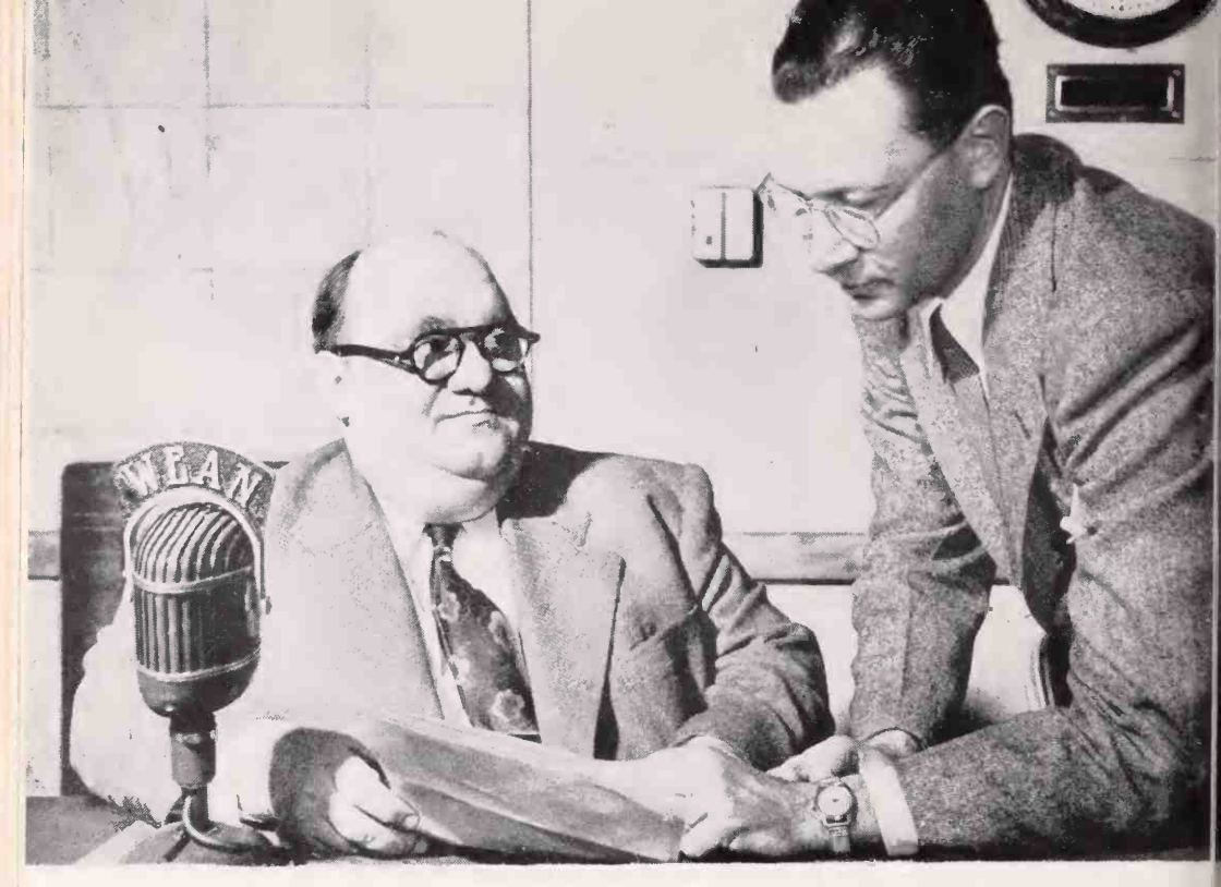
Station announcer and guest doctor going over interview script before broadcast