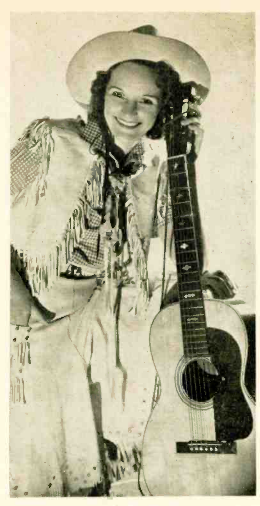
Patsy Montana, singing cowgirl on the WLS National Barn Dance. WLS, Chicago, always dresses in cowgirl fashion for personal appearances now. But her first appearance as a stage cowgirl was made in a black evening gown. It still embarrasses her to think about it.

Patsy was too stiff competition; so they asked her to join their act.