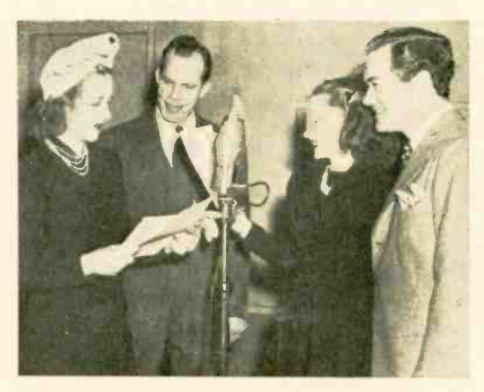
"YOUR FAMILY AND MINE"

★ Its audience has grown—and is growing—steadily, showing that the public appreciates an intelligent handling of a vital topic: family life. This interest in the daytime show has developed since its first presentation on the air Monday. April 25, 1938.