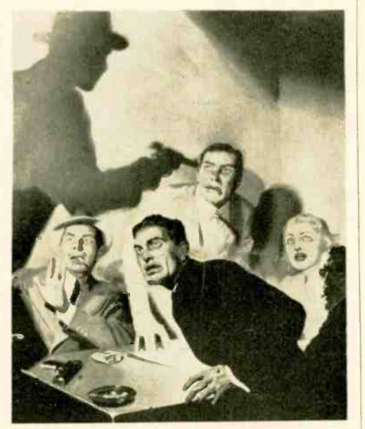
The Adventurous Green Hornet gets his man

Before the program became an NBC weekly over the National Broadcasting feature in November, it passed through Company's Blue Network. The central a stiff process of experimentation, recharacter is Britt Reid, crusading young writing and recasting. The smallest denewspaper publisher, who sallies forth tail was checked and, with apologies to to war on corruption under the nom de that famous black-face team, doublechecked. Even the whining hornet call