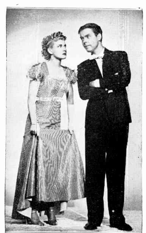
Penny Singleton, plays the part of Blondie. Arthur Lake, plays the role of Dagwood

When Penny and Arthur are in production on one of the "Blondie" picture series, the schedule gets pretty heavy, with the two stars setting their alarms for 4 a.m. to start picture work literally at the crack of dawn. They leave the set for early rehearsals of the broadcast, grab lunch, report for the final "polishing" radio rehearsal at 1 p.m. They usually put in a 15-hour day on the Mondays of the airshow.