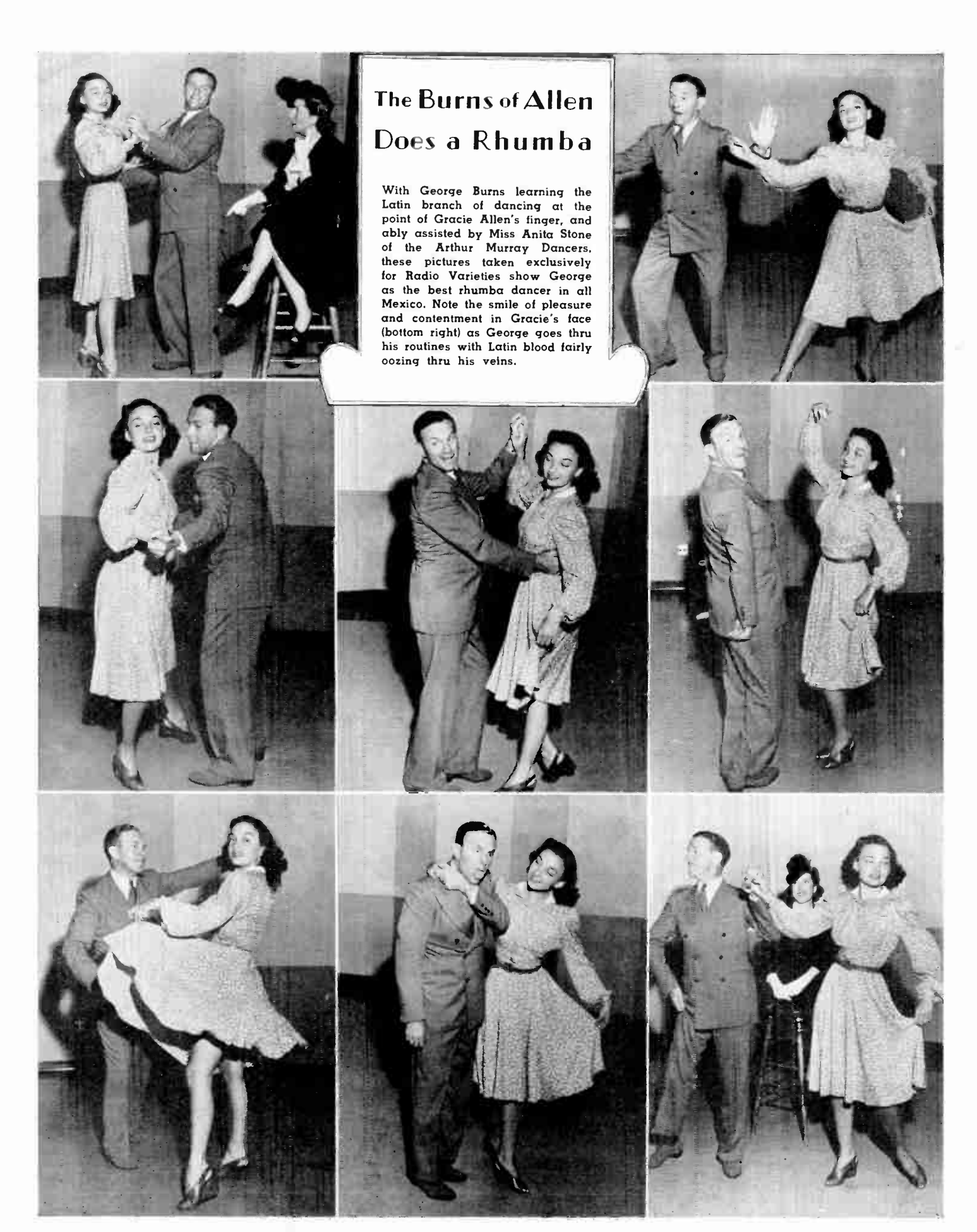
World Radio History