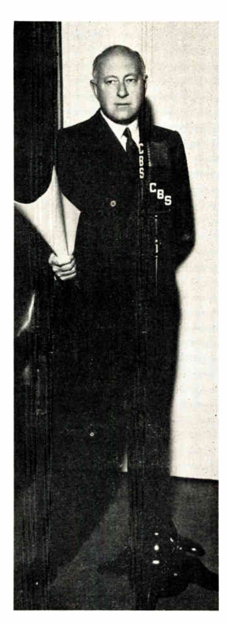
CECIL B. DEMILLE

"There are 15,000 men storming that hill, sir.'