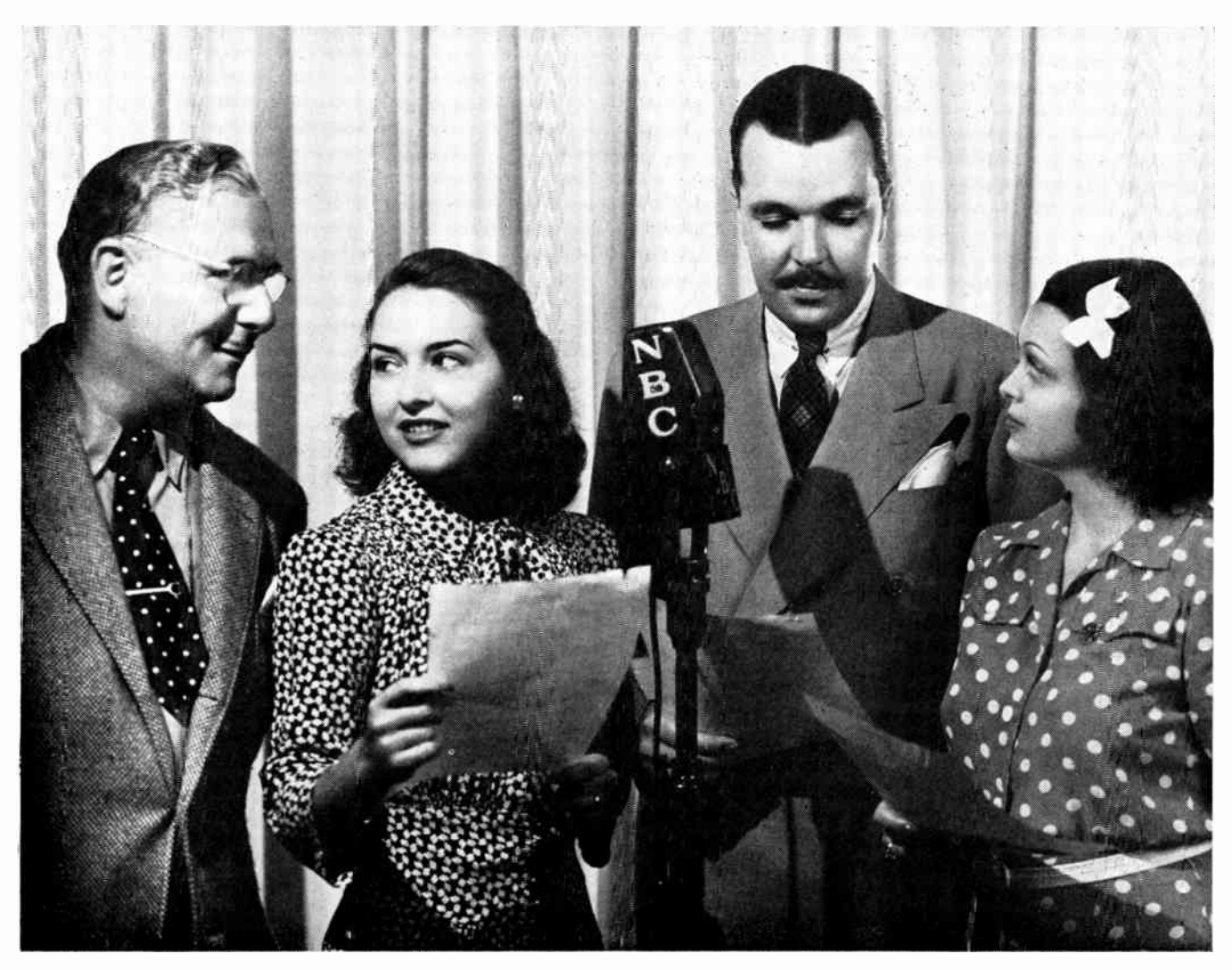
LIFE CAN BE BEAUTIFUL — If you don't believe it ask the above members of the cast of Life Can Be Beautiful, NBC dramatic serial heard Mondays through Fridays