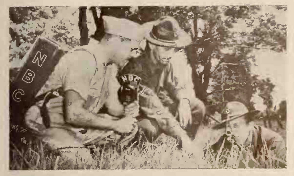
The portable microphone and transmitter picks up the rat-a-tat-tat of the deadly U. S. Army improved machine gun.

fills its task in preserving Democracy as we know it in the United States of America