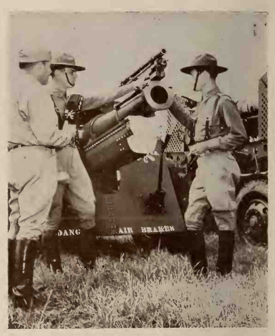
The National Broadcasting Company, cooperating with the federal government in the development of the national defense effort, goes into the field to bring radio listeners first-hand descriptions of activities underway. Most recent undertaking will be the tour of the country's thirteen conscription army training camps for a series of on-the-spot broadcasts describing the processes by which civilians are turned into a reserve of trained manpower.

Radio, which enjoys the full freedom accorded it by a Democratic from of Government, ful-