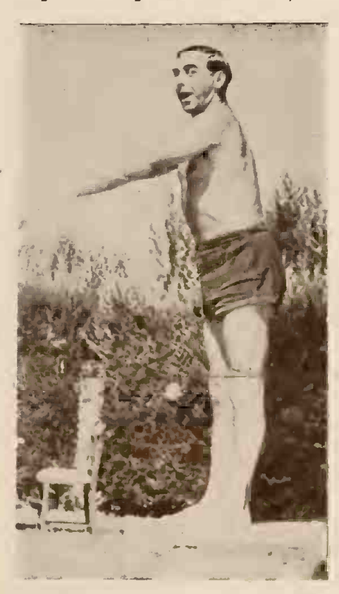
Eddie Cantor keeps in trim by taking a plunge each morning in his private pool on his California estate

The pluggers get the drift and leave. Eddie, still humming the tune, sits down at a bridge table for his first meal of the day. Bells begin to ring: the door bell, the