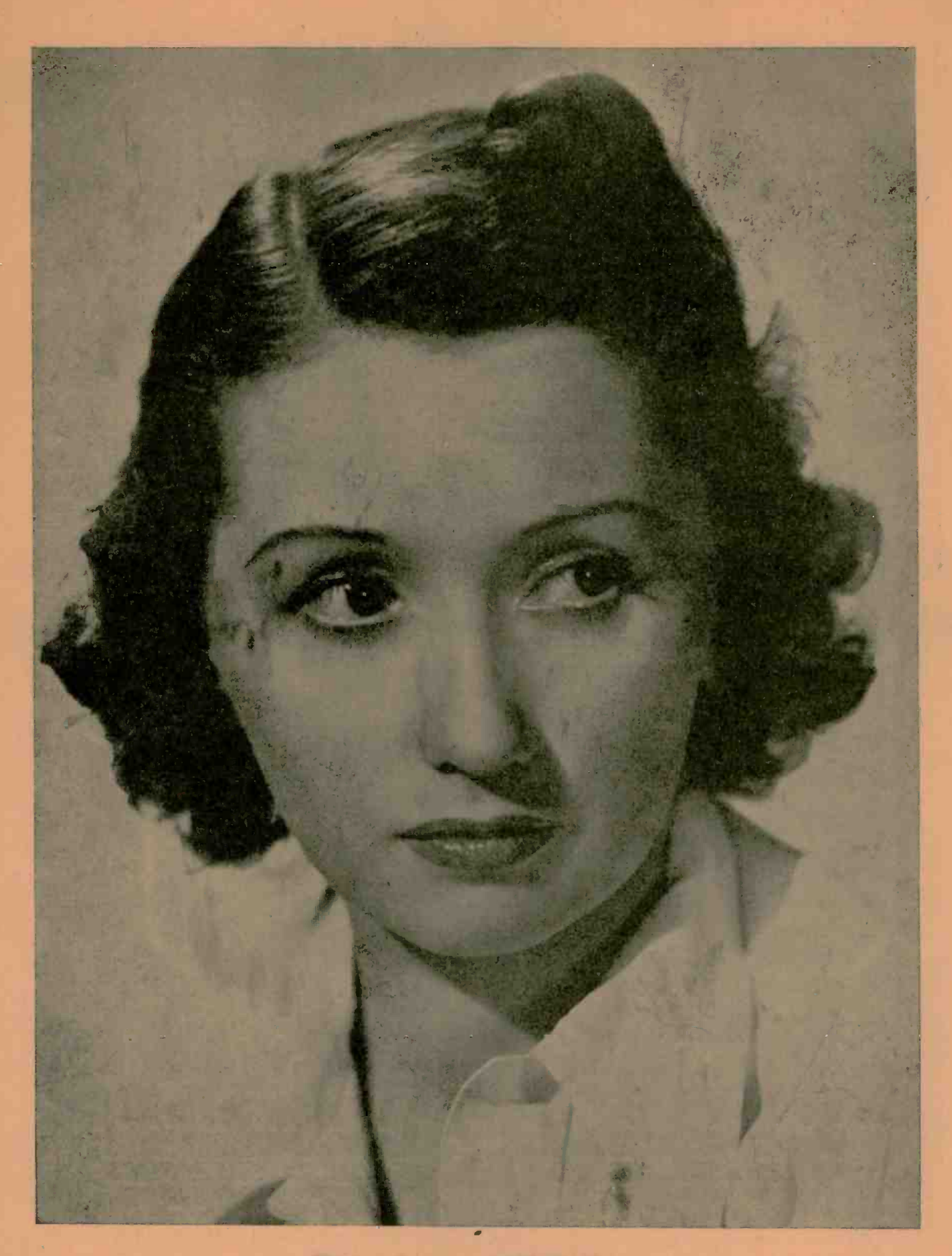
Rita Ascot WLS Star