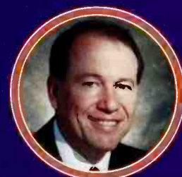
Saturday, September 14 Radio Luncheon