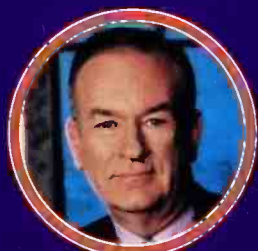
Friday, September 13 The NAB Radio Show Keynote