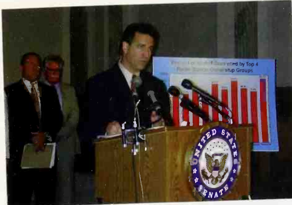
Sen. Russell Feingold (D-WI)

The bill does not try to unwind the Telcom Act but put in measures to put radio consolidation under tighter controls. (see Outline of the Competition in Radio and Concert Industries Act on page 4). The harshest penalties are for anti-competitive behavior. Feingold wants to "prohibit any entity that owns radio stations, concert promotion services, venues from acting in an anti-competitive manner." His bill wants "the Federal Communications Commission (FCC) to revoke the license of any radio station that uses its cross-ownership of promotion services or venues to discriminate