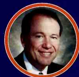
Saturday, September 14 Radio Luncheon