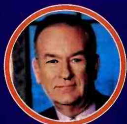
Friday, September 13 The NAB Radio Show Keynote