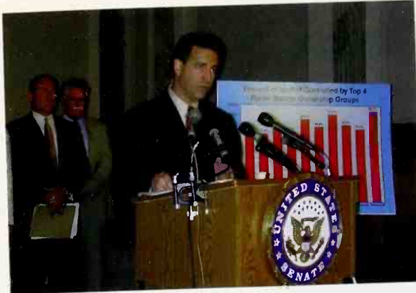
Sen. Russell Feingold (D-WI)

The bill does not try to unwind the Telcom Act but put in measures to put radio consolidation under tighter controls. (see Outline of the Competition in Radio and Concert Industries Act on page 4). The harshest penalties are for anti-competitive behavior. Feingold wants to "prohibit any entity that owns radio stations, concert promotion services, venues from acting in an anti-competitive manner." His bill wants "the Federal Communications Commission (FCC) to revoke the license of any radio station that uses its cross-ownership of promotion services or venues to discriminate