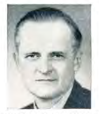
(THE SOLEMN OLD JUDGE)