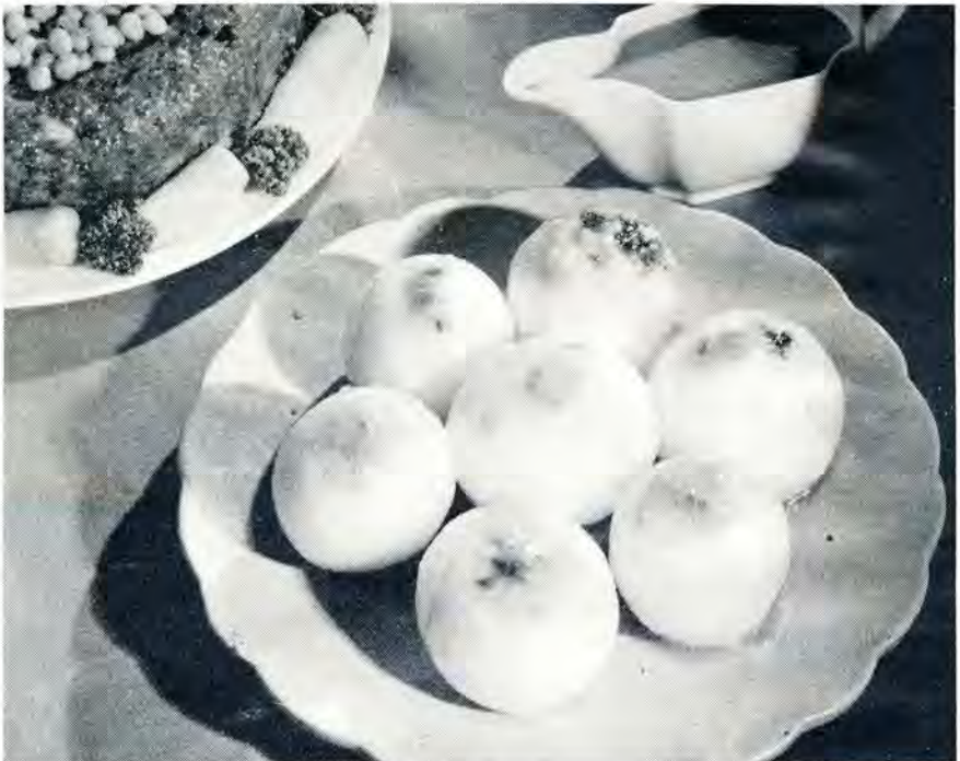
Paprika Glazed Onions are enough to make humble Meat Loaf or haughty Prime Rib Roast sit up and take notice. And when they're done with Idaho Sweet Spanish Onions, YOU may take a bow!

Most vegetables may be served but-After they are boiled and drained, they should be returned to