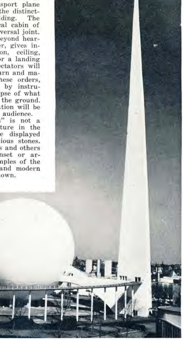
THEME BUILDINGS OF THE NEW YORK WORLD'S FAIR

The Perisphere and Trylon—unique structures which dominate the architecture of the New York World's Fair, 1939. Within the 200-foot Perisphere visitors will view from revolving platforms suspended in midair, a dramatization of the World of Tomorrow. Clusters of fountains will screen the columns supporting the sphere so that the great ball will appear to be poised on jets of water. By night it will seem to revolve. The 700-foot three-sided Trylon will serve as a Fair beacon and broadcasting tower.