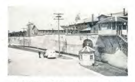
Outside the Walls of the Texas State Prison at Huntsville. Showing WBAP's mobile broadcasting unit parked just outside the gates of the penitentiary.

With this talent as a nucleus, plans for the future were made. Others behind the walls began to study and practice just for the privilege of being on the air a few minutes each week. To vary the programs a series of interviews with interesting prisoners was soon initiated. A newcomer described his impressions. A member of the notorious Hamilton gang talked. A temporary resident of a death cell told of his feelings.