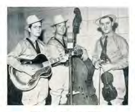
THE RANGERS, WIS

The Rangers remained at WLS until 1935, playing on such well-known programs as Smile-a-While, Morning Devotions, Olson Minstrels, Homemakers'