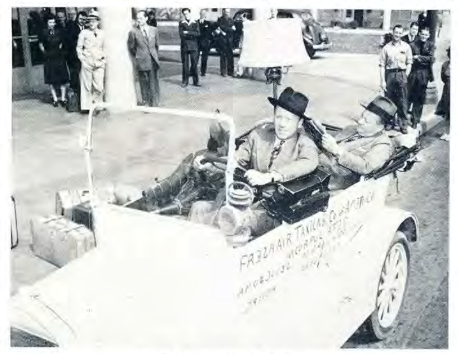
AMOS 'N' ANDY IN PERSON

"Just lock her in a room jam-full of new spring hats and no lookin' glasses!"