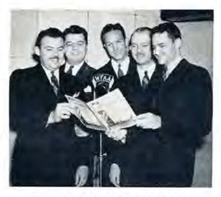
THE PLAINSMEN QUARTET

As the Plainsmen Quartet, however, the group prefers radio work to personal appearances, several of which they make every month. They are very proud that, during the 1937-38