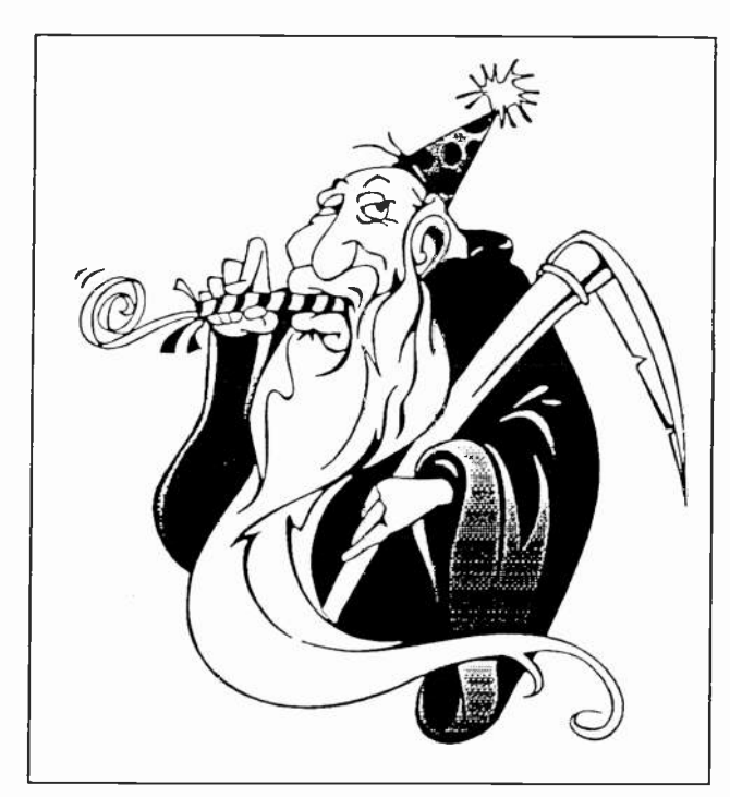
Happy New Year from SMRN!

Snowblower Contest. Work a deal with a local dealer for the use of a snowblower for a