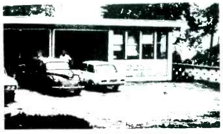
Studio Building at Sans Souci

FEBA is a missionary radio station built to propagate the Christian Faith and to "teach the things concerning the Lord Jesus Christ It is undenominational in character and is supported by Christian churches and groups in many lands.