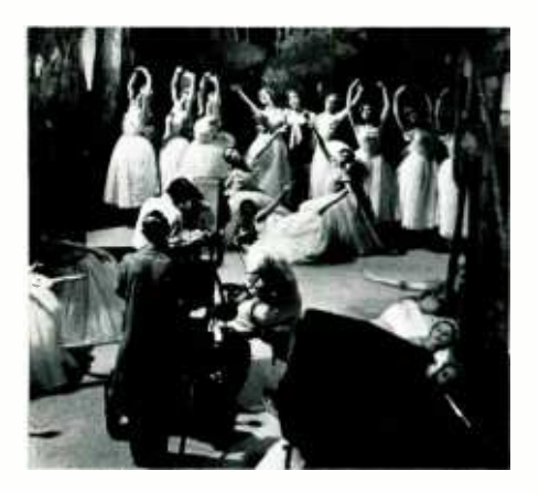
A pre-war B.B.C. television show. Lighting, costumes, make-up and scenery are added to ordinary radio problems.

Television has been in operation in some cities for many years. We had a week of it in Winnipeg at a well-known