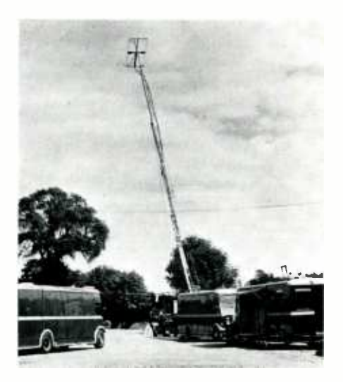
B.B.C. mobile television unit. The antenna raised on an extension ladder.

It is not my purpose to discuss the relative merits of the various methods of bringing up broadcasting. The point is that broadcasting burst upon us as an entirely new form of entertainment and education the like of which mankind had