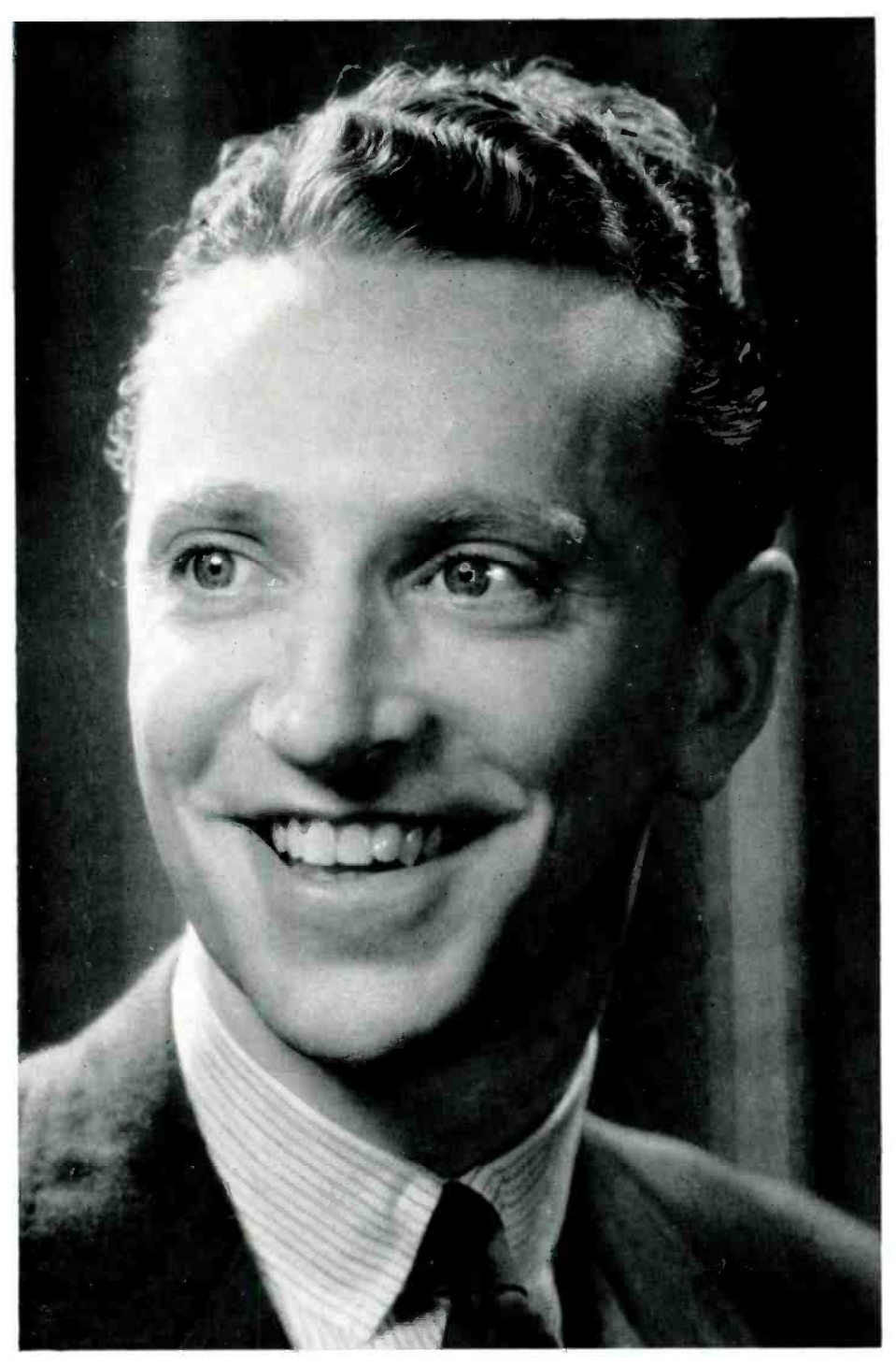
BERT PEARL OF "THE HAPPY GANG"