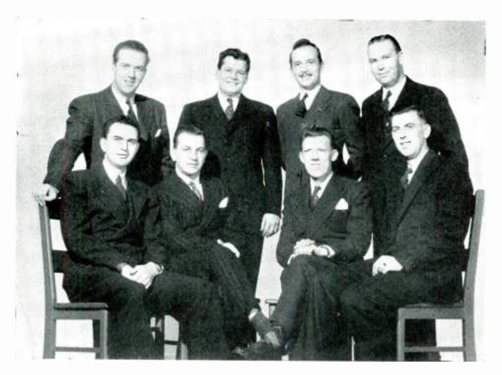
Heard in "Jolly Miller Time", sponsored by the Maple Leaf Milling Company, on CKY Wednesdays at 7.00 p.m.