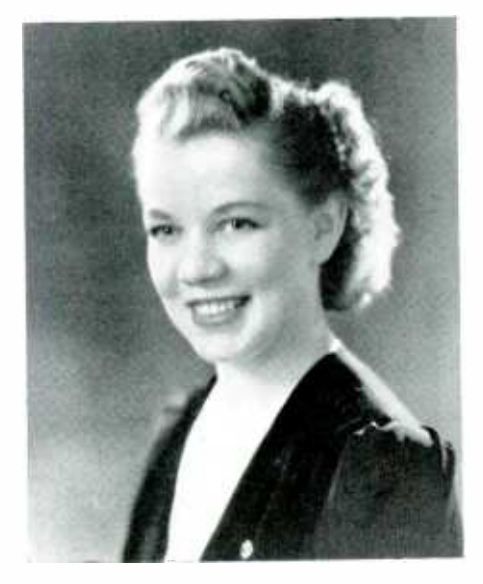
TALENTED, AND CHARMING, TOO

So, today, there are hints of new things to come after the war—television, freed of present handicaps, improved transmission and reception of musical entertainment, marvellous applications of radar, etc. When these babies are brought to us, however, we shall be in a somewhat better state of preparation because of our experience gained since the inventive stork embarrassed us with the infant radio. The babies in