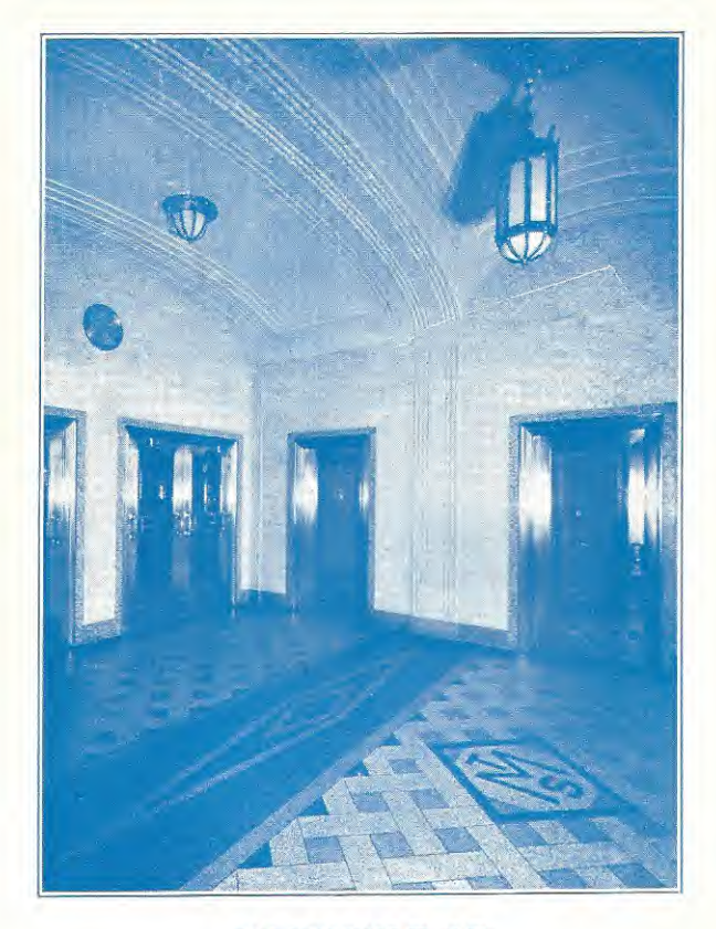
VESTIBULE OF THE TELEPHONE BUILDING WINNIPEG

The Studios and Offices of CKY occupy the Third Floor