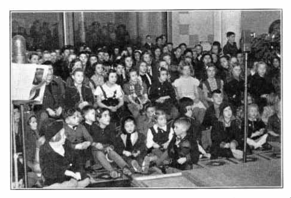
Assembled in the studio, they receive instructions regarding the program, and away they go in the introductory song "School-days, school-days"! Here we see them awaiting the signal to start. Behind the glass are visitors in the observation room

Each Saturday morning, the corridors of CKY are filled with girls and boys on their way to participate in the T. Eaton Company's "Good Deed Club" broadcast, which goes on the air at 10.30 a.m.