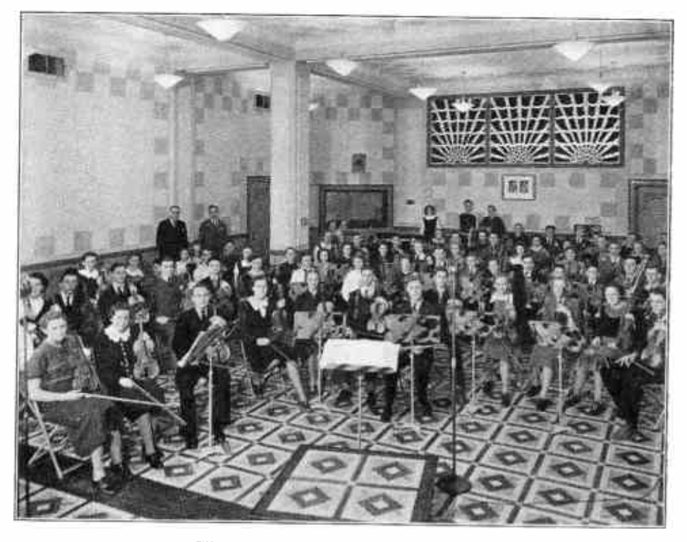
High Schools Orchestra in Studio I.

joining it, and entered by a separate door opening from the vestibule, is a control room equipped with mixing panel, etc. Here, the program director and the control operator can observe the performers and listen to the program by means of a loud speaker and headphones. We pay a brief visit to this room, and then our guide takes us along the vestibule and pauses at a door. "Now," he says, "we shall see our finest studio."