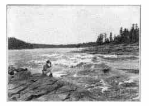
The Boundary rapids, where the Winnipeg river crosses the Ontario border and enters the chain of lakes.

was difficult, the water being dangerous under the influence of a strong wind, but the map guided us to Boundary Falls, at which point on the Ontario border the Winnipeg river enters the chain of lakes. Thenceforward this mighty water-course became our pathway for over fifty miles, although the river seemed to be nothing more than another series of tranquil lakes, connected by narrow gorges of faster moving water. All along the river we passed unexploited forest land, blocks of it however still revealing the partly healed scars of recent destructive forest fires. Secure in the fastness of these woods we made ideal camps on sites unchanged since they were used by La Verendrye and all those who passed by as they wove the web of western pioneer history, or we rested on portage trails which had been little disturbed since those days when the cliffs and forests echoed the rollicking songs of the coureur du bois.