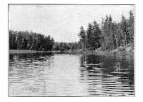
A quiet reach at the head of Crow Duck Lake

By car we covered the Trans-Canada highway as far as Rennie, thence by secondary road leading past beautiful