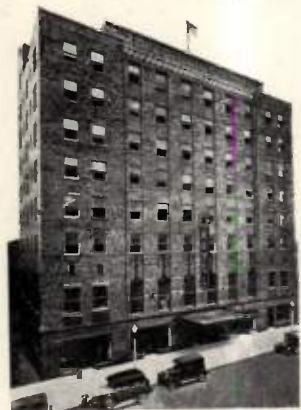
HOTEL SUNFLOWER Across the street from KFBT