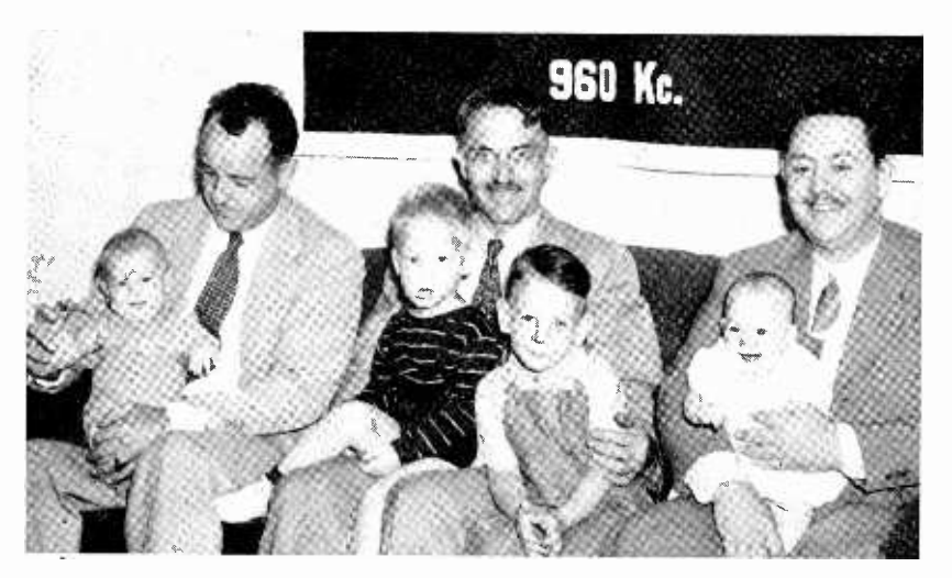
The 7:15 A.M. Family Party

It really is surprising to find out how interested the listeners are in the families of the folks they hear on the air, and already we are getting calls for pictures of the wives sometime. Well, we'll see. Right now the girls are all three so busy taking care of the stuff we men folks drag home from the garden every night that I wouldn't even tackle the job of trying to get them together for a picture. You know how these women are about pictures. Their hair has to be fixed just so, and right now you have to make a date at least two weeks ahead to even get a finger wave.