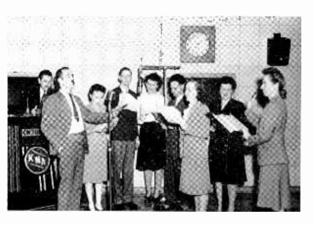
THE PROGRAM IN ACTION

What's more these programs are the only source of authentic educational news you have, for nowhere else can you find what is happening in education in your (Continued on page 7)