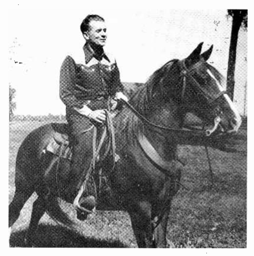
(See Page 6)