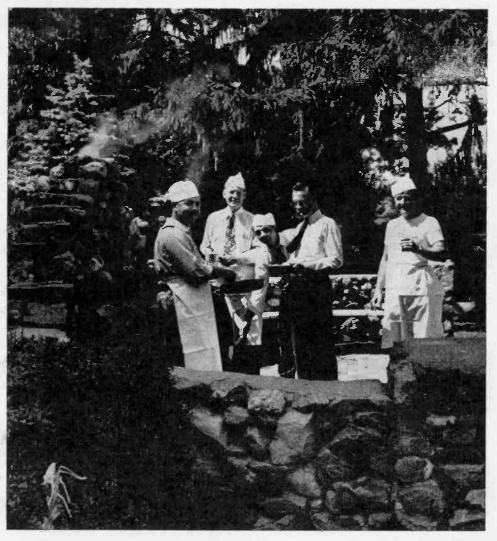
Kings Of The Outdoor Kitchen