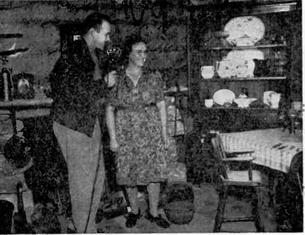
100 yr. old Pioneer Cabin

sports broadcasts, we've very good news! The U.S. Army recruiting service is sponsoring several major football games this fall. Make a note of these dates: Oct. 5 at 12:45 p.m. the game of Cornell and Army will be aired from West Point; Oct. 12, at 1:45 p.m., you can hear the game between Michigan and Army at Ann Arbor, Mich., on Oct. 19 at 12:45 p.m. the Army-Columbia game will be on KMA; on Oct. 26 at 12:45 Army meets Duke; on Nov. 2 at 12:45 p.m. West Virginia walks into Army territory, and on Nov. 9 at 12:45 p.m. the classic of the season, Notre Dame vs. Army will come to you over your favorite station.