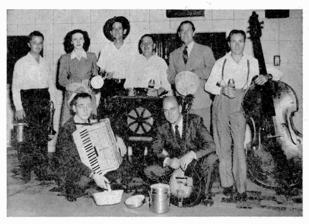
Music and Fun, while you eat!

V. S. Postage Paid Permit No. 1 Shenandoah, Ia.