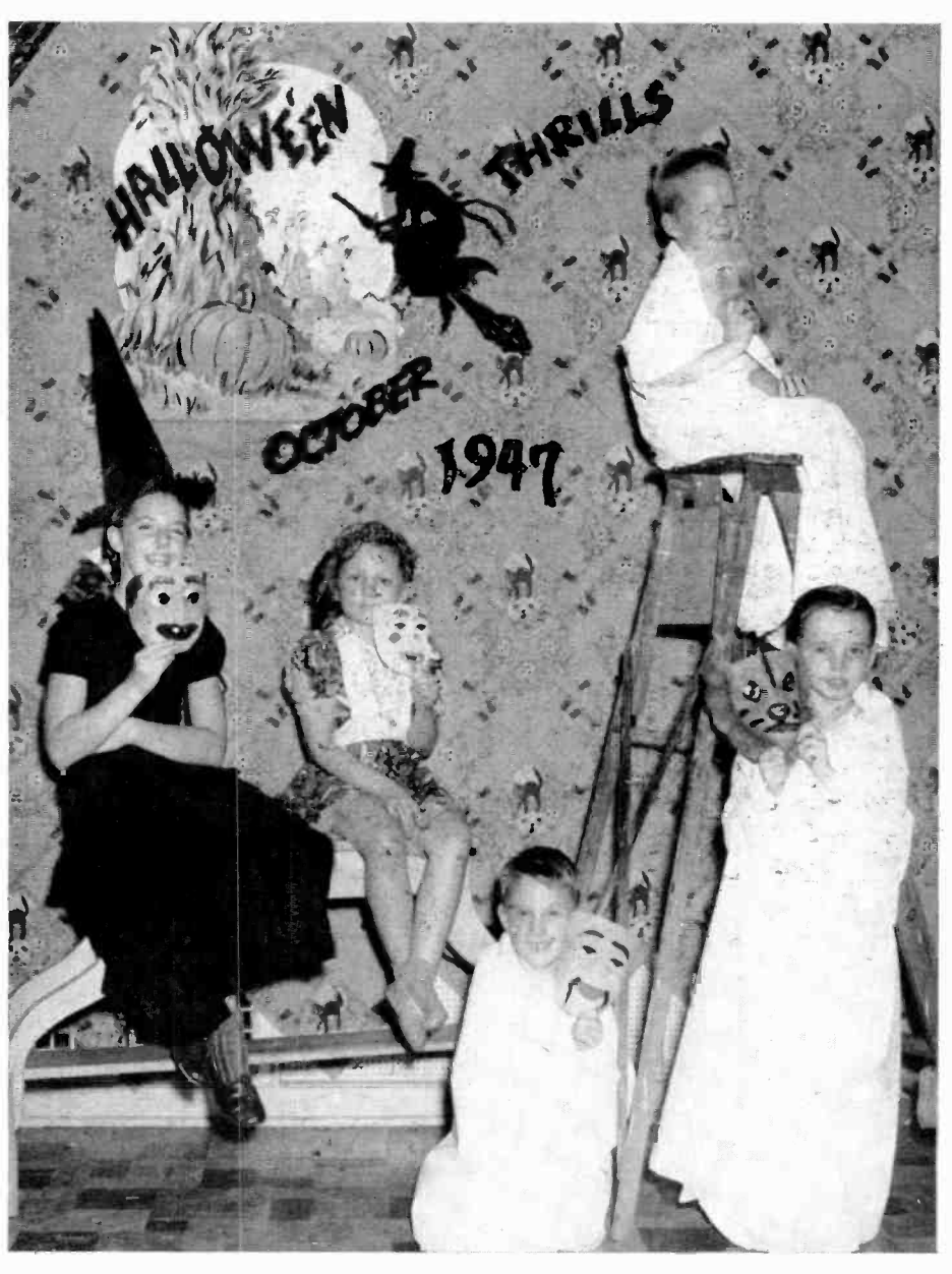
"The Goblins Will Get You If You Don't Watch Out" (Story on Page 5)