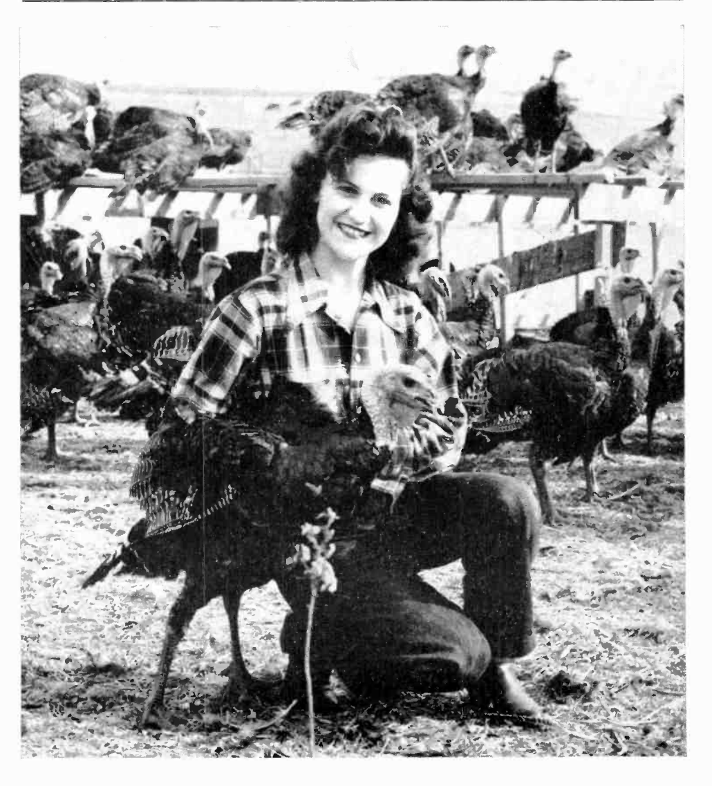
WHO SAID TURKEYS DO NOT LIKE "PERSONAL" ATTENTION? (Story on Page 6)

"THE MAGAZINE ABOUT YOUR FAVORITES ON YOUR FAVORITE STATION"