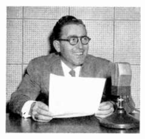
Now it can be told.

For 12 years radio listeners near Salina, Kans., have been trying to solve the Mystery of the Masked Singer who appeared and disappeared within a few heart throbbing months.