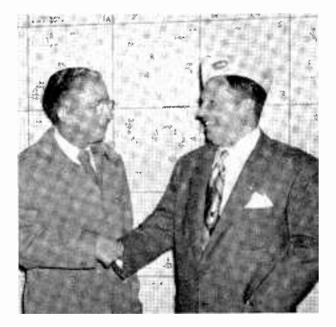
Office Work Too!

Remember! Jan. 15-30 is the March of Dimes.