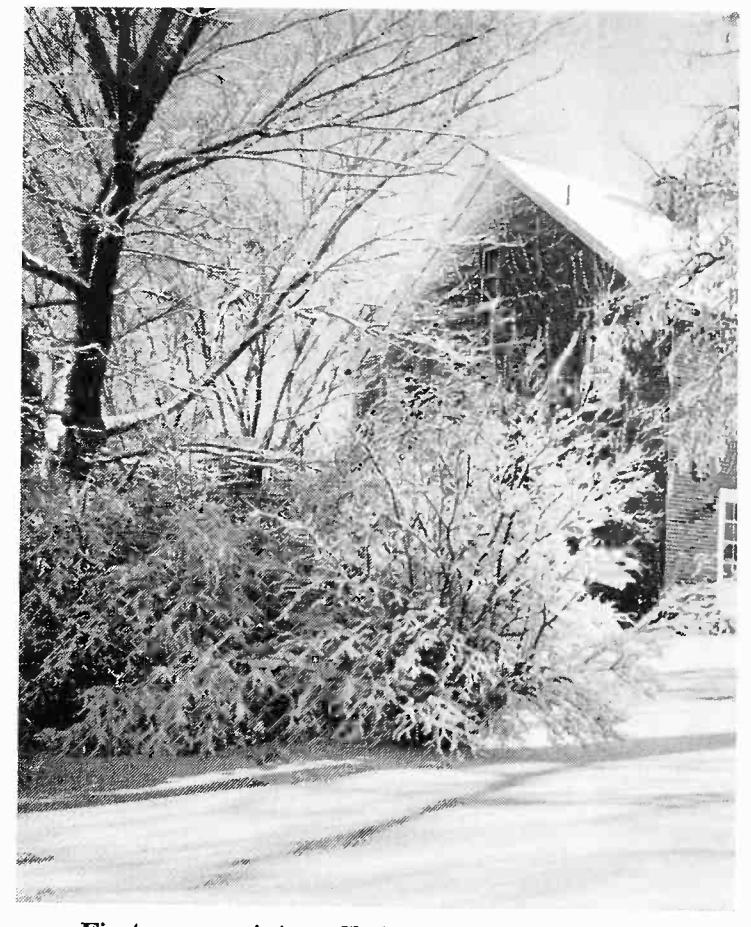
First snow paints a Christmas scene of beauty. December, 1955

Mr. Valentine looks to the trees as an indication of each winter regarding temperatures. For example, when all of the leaves fall from the trees this indicates a mild winter temperature-wise, but when only a