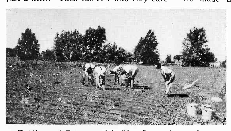
Putting out Pansy seed in May Seed trial gardens.

Pansy seed of the strain which we use, is very expensive, and sowing the seed with an ordinary garden drill would be rather wasteful, so the seed was very carefully dropped by hand and covered by hand. The two boys headed to the left or away from me, are dropping the seed, and the two boys headed to the right, or back toward me, are carefully covering with finely ground peat moss. In order to get exactly the right amount of seed in each row, the seed was first put up in regular packets with just the amount of seed in each packet to do a row 30 feet long, with the seeds averaging about one inch apart. Then the field was marked out in rows 20 inches apart and about three-quarters of an inch After the seed was scattered evenly in the row, the little furrow was completely filled with peat moss, and in fact ridged up just a little. Then the row was very care-