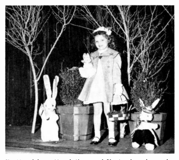
Pretty girl, pretty clothes, and Easter bunnies make a perfect setting for the Spring season.