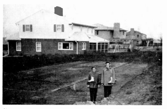
Karen and Annette, ice-skates over their shoulder, stand on ground levelled for neighborhood skating rink, just two doors from home.

January is the month the seed catalogues are mailed. These catalogues with their beautiful pictures of flowers and vegetables somehow seem to make the winter seem shorter. Even though the temperature might be zero outside it doesn't seem nearly as cold when you look through the seed catalogues. Perhaps the catalogue is a reminder that spring is just around the corner and the cold days of winter are numbered. It has been said, "There are two books which should be in every home and read by every member of the family. They are the Bible which tells of the miracle of God and the seed catalogue which proves it."