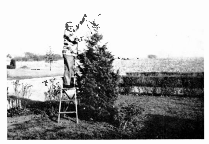
Our Douglas Fir called for a ladder to reach the top with Christmas lights this year. A fast-growing beauty.

It didn't quite seem like Christmas this year with no cold weather to speak of and no snow on the ground at all. I am writing this on the next to the last day of 1958 and so far in December we have had five hundredths of an inch of moisture, and the only snow we have had came on the day after Thanksgiving Day when we had about an inch and a half which melted off in just a day or two. This dry winter is extremely hard on Evergreens in general, and particularly so on Junipers and Spruces. During the month of November, I gave all of our shrubs and Evergreens and trees a good thorough soaking, putting on the equivalent of at least an inch of rain. Then about the middle of December during one of those warm spells, I did the same thing again. But even so, the ground is cracking badly all over the vard. If we have a warm spell during January, I am going to water everything again as there is danger of winter killing unless we get a lot more moisture than we have had so far.