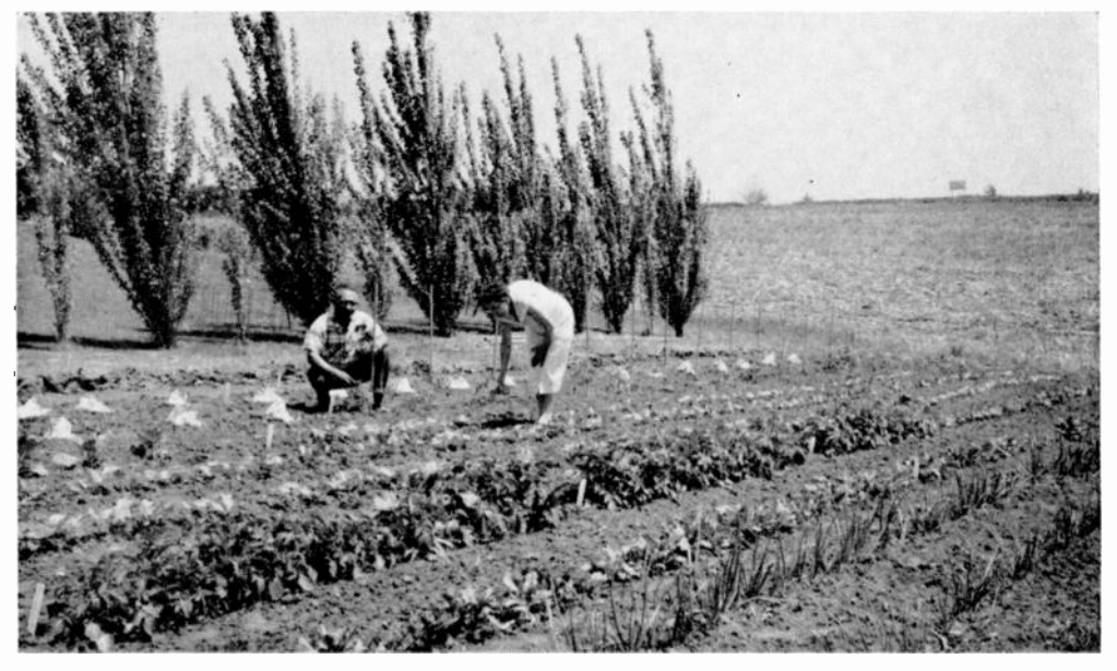
The KMA Guide