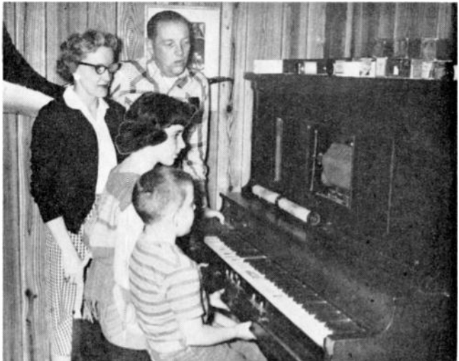
Old player brings new fun to Mays.

This is relative season. School is out and people are planning vacations. Thousands of visitors will probably go to the Black Hills, Estes Park, Yellowstone National Park, Minnesota, Wisconsin or some other place of interest. I don't know if you have any plans or not, but why don't you give serious thought and plan to go visit some of your relatives. How long has it been since you have visited your brother, sister, aunt, uncle or other relatives that you think a lot of? All too often the only time we see some of the relatives is at a funeral when some member of the family has passed away. Its tourist season, which can mean relative season; do you have any plans to visit the relatives?