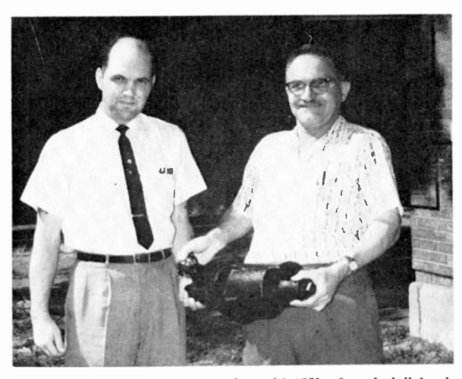
Burlington Railroad helps bring old "Wooden Axle" back to life.

I was expecting to get a brass whistle about the size of a quart milk bottle which would be no trouble at all to install on the car. Imagine my astonishment and surprise when it arrived to find that whistle was actually as large as a nail keg and weighed over 40 lbs! Instead of being made of brass, it was made of cast iron and was a chime whistle, blowing five notes at the same time to make a beautiful chord. It was threaded for 2-inch pipe and as a matter of fact, the whistle itself is larger