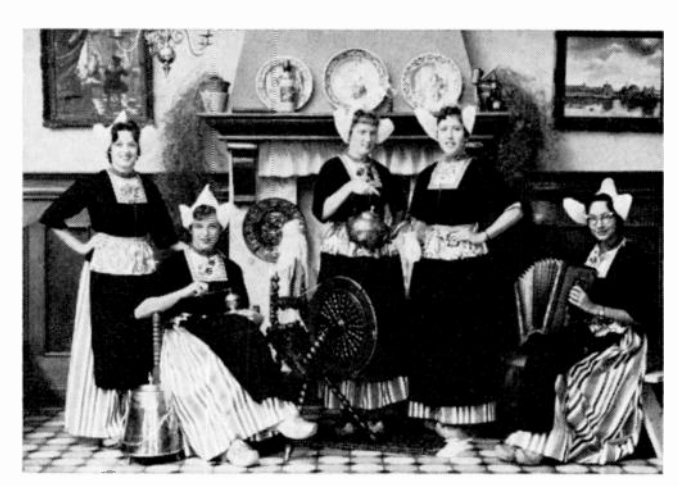
"Dutch Girls" pose for own benefit. Insistent American shutter-bugs surprised by disguised fellow-countrymen.

own age. We were intensely interested in exchanging views and stories of homelife in our respective countries. All too soon the shores of England appeared. Europe's finest guides were at dockside to conduct us, and care for our every need throughout our coming journey. Their attention to detail and helpful advice was perfect. We spent four days in London taking in a world of historic sights, including side trips to Stratford-On-Avon, Stoke Poges, Oxford, and many others. There was time to poke around in old streets, riding bus tops, theatres, amusement, shopping, and rest. We bid farewell to the charm of old England and crossed the North Sea by small boat. The rough channel lived up to its reputation and all I did was hang on my upper bunk during this overnight trip. We docked at the Hook of Holland and proceeded to our Holland headquarters resort of gorgeous Scheveningen, Holland. Here we forayed a land of dikes, windmills, a labyrinth of canals and drawbridges, flower bedecked countryside, amid the clatter of wooden shoes. We visited Amsterdam, the Ryks Museum with its famous Rembrandt, "The Night Watch", a diamond factory, and The Hague Peace Palace. Several of our