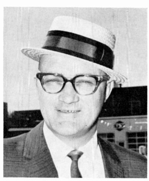
The KMA Guide