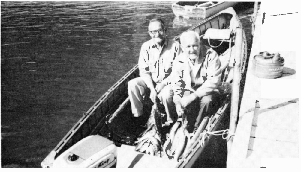
The KMA Guide