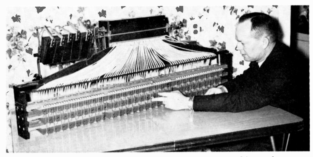
You push the little valve down and the vacuum goes round 'n round.