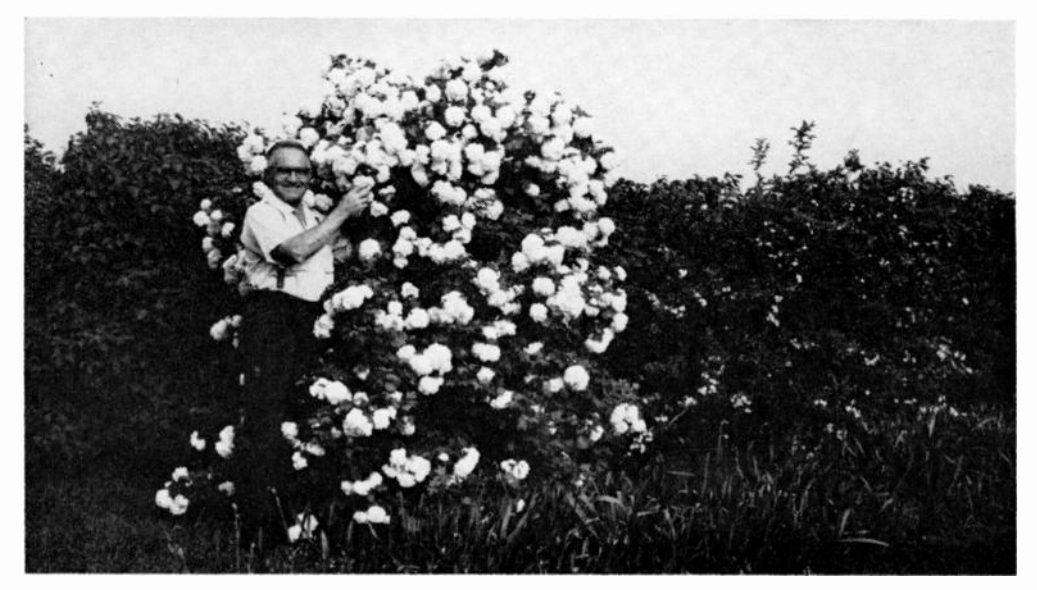
The KMA Guide