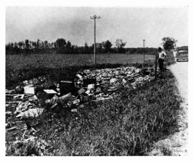
Sign says "No Dumping Allowed".

One other thing, rake the hay when it is about 50% moisture, it will take longer to