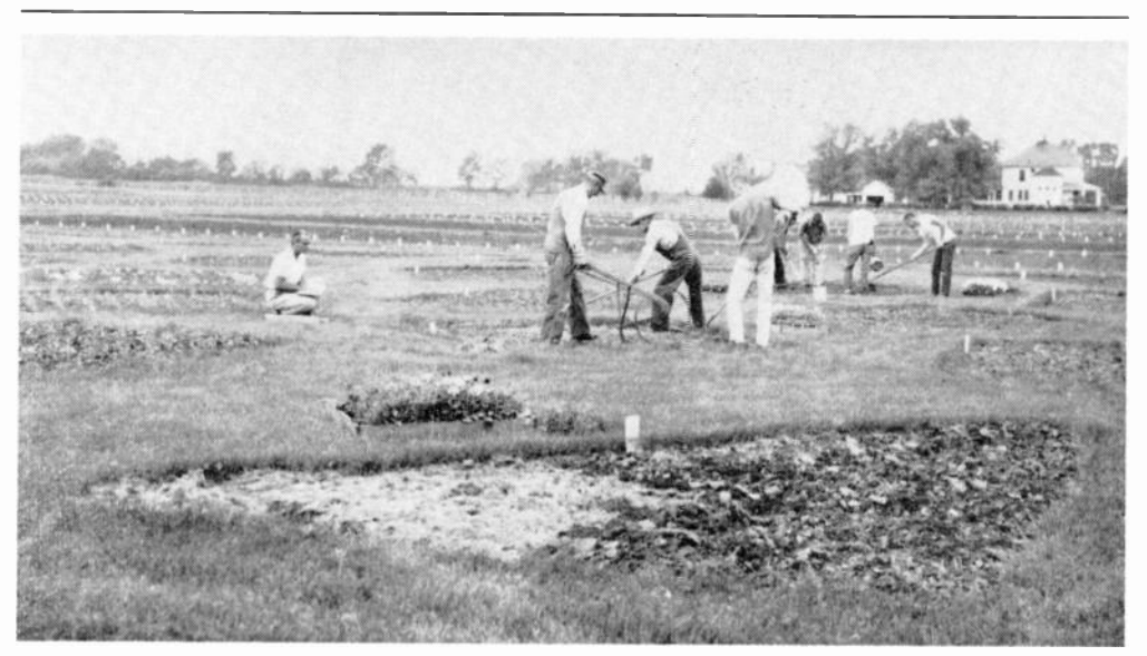
May Seed & Nursery Company Trial Grounds crew began planting border beds May 18. Will reach peak of bloom by late July for Open House.

Yes, the garden is coming along nicely the tomatoes are all staked and have been pruned and tied twice now, and barring a severe hailstorm, it looks like a bumper crop. Like I said last month, all of our tomatoes this year are two new varieties which we plan to introduce later on. One of them will be in the catalog this coming year and the other, the following year.