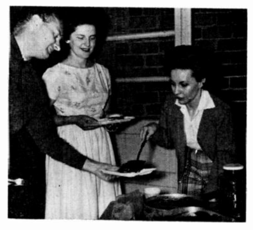
The KMA Guide