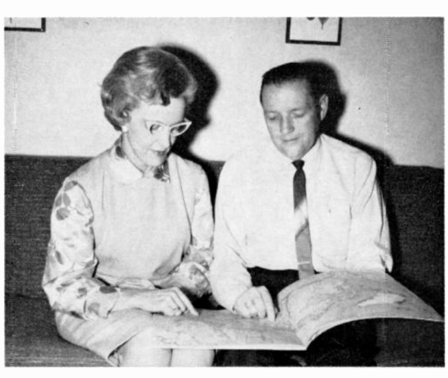
Wife Eleanor and I look over Atlas map of Old Mexico, anticipating wintertime trip to sunny climate.

Spring is only a few days Continued on Page 19