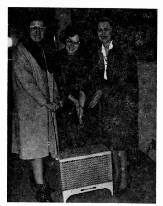
Office trio huddle over heater as furnace goes on the blink.