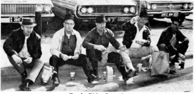
Curb Side Lunch

The more facts Jack dug out, the more alarmed he became. At the red meat import conference in St. Louis during February Jack picked up much more information which indicated the cattle industry had a serious problem on its hands, a flood of imported beef.