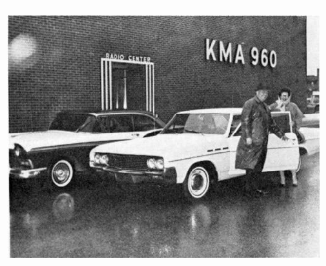
Happy day-keys to new car and just in the nick of time. Old car (background) had to be towed in.