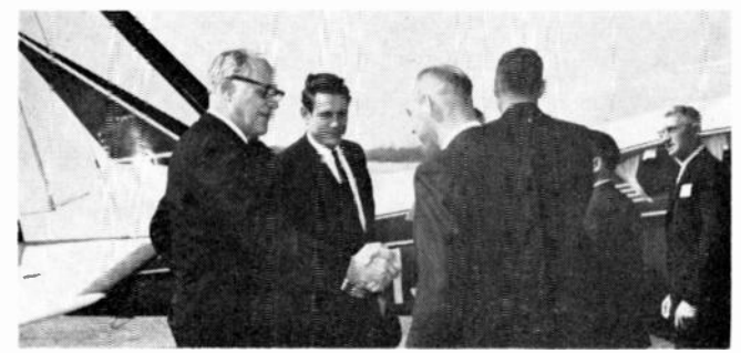
V!P's Fly In