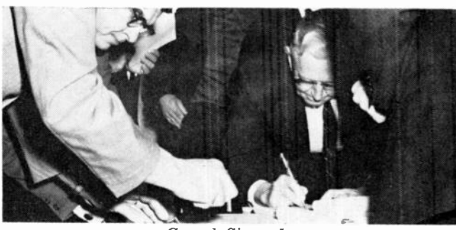
Crowd Signs In