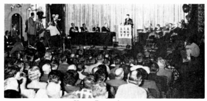
Huge Press Cover