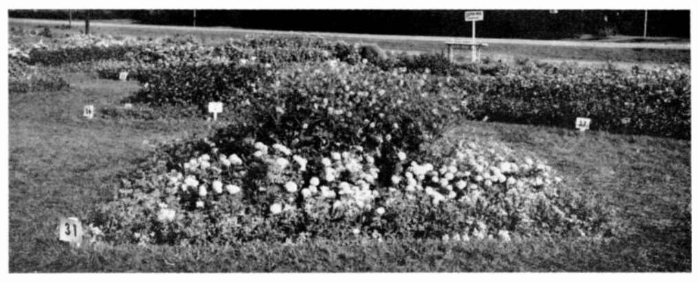
THE WINNER - Those who picked bed No. 31 win the entire assortment.