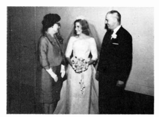
The KMA Guide