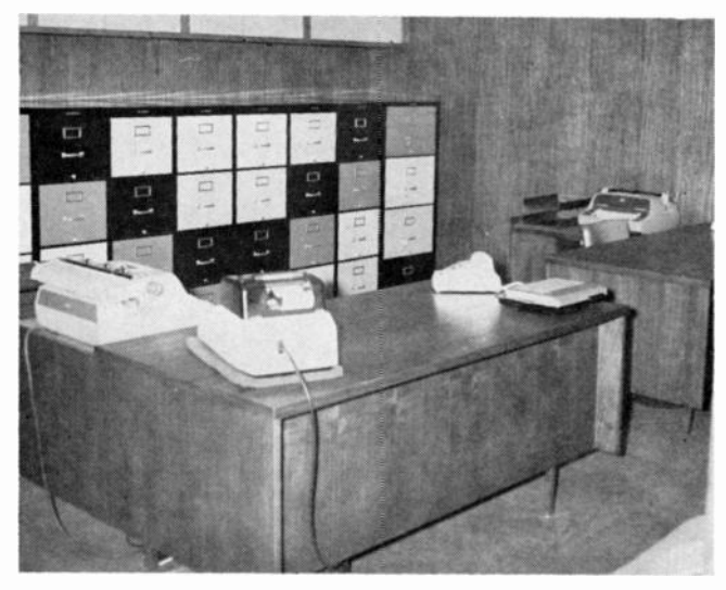
Filing cabinets brighten secretarial office.

The conference room, like the other two, is paneled, but in Rosewood. This is matched by the Rosewood Formica of the conference table. The comfortable chairs