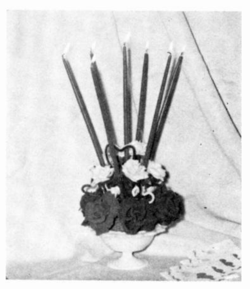
Easy Valentine centerpiece.

Dissolve raspberry gelatin in 1 cup of boiling water. Stir in 1 pint of vanilla ice cream and 1 package frozen raspberries until gelatin thickens. Spoon into cooled baked pie shell. Chill until firm.