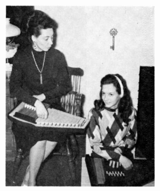
Teacher and pupil play autoharps,