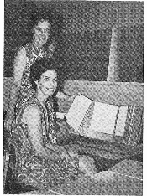
The Traffic Department.

Although you don't hear about the Traffic Department over the air, you may be sure that without it we would not be able to bring you the radio programs that have made KMA your favorite radio station.