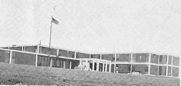
Dedicated in October, 1968, the Cass County Memorial Hospital has a capacity of 106 beds.