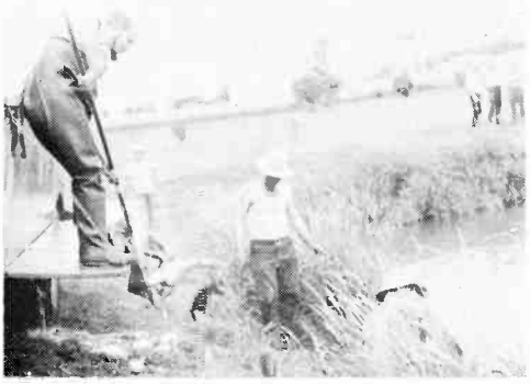
Stanton Park Lake is stocked with fish each summer, and sports enthusiasts enjoy ice skating on the frozen lake in the winter. Stanton Park is located on the northwest edge of town,

Pictures. courtesy of Falls City Journal