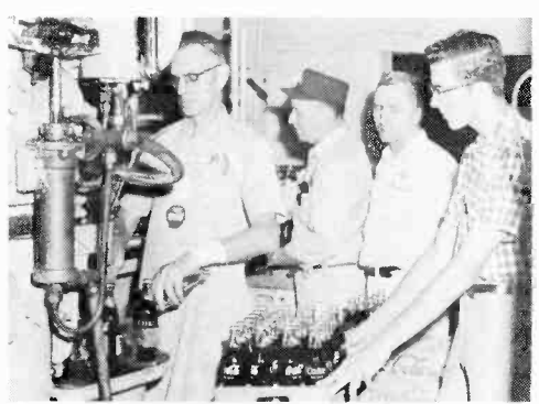
Workers supervise assembly line bottling at the Coca-Cola Bottling Plant.