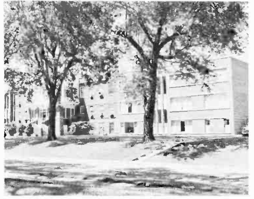
The Falls City Community Hospital has a 42 bed capacity and 8 bassinets; this includes the new 14-bed additional wing recently built.