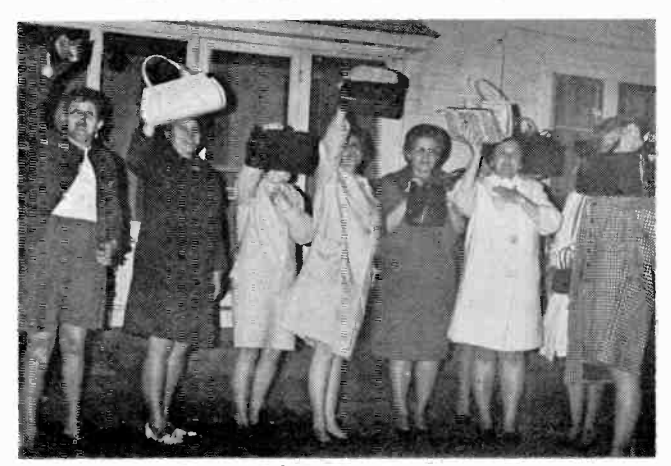
Group shakes purses at moon.