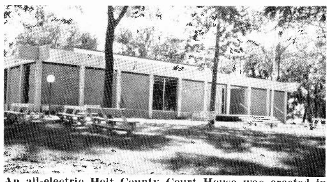
An all-electric Holt County Court House was erected in 1966 to replace the historic 114-year-old building which burned in 1965. The new brick building housing the county offices was built at a cost of $200,000.

New construction and remodeling projects totaling nearly $500,000 are underway for the South Holt R-I school at Oregon. A new gymnasium, locker rooms, industrial arts and music facilities are being built. The present gymnasium will be remodeled to include classrooms for kindergarten and grades 1-5.